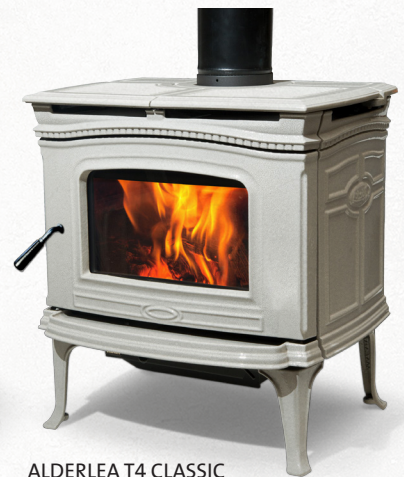
ALDERLEA T4 CLASSIC

For reference only. Installations should be based on installation manuals. Specifications subject to change.